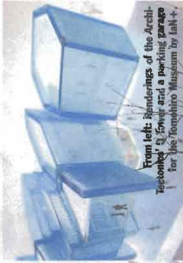
From left: Renderings of the Archi-Tectonics' Q Tower and a parking garage for the Tomohiro Museum by Ian +.